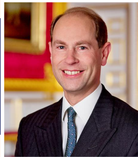
HRH The Duke of Edinburgh, KG GCVO Patron.

We are delighted, as ever, to be holding this event at the superb Emirates Arena. It really has proved to be the most fantastic venue for Badminton , providing great facilities for players, officials, staff, volunteers and spectators alike.